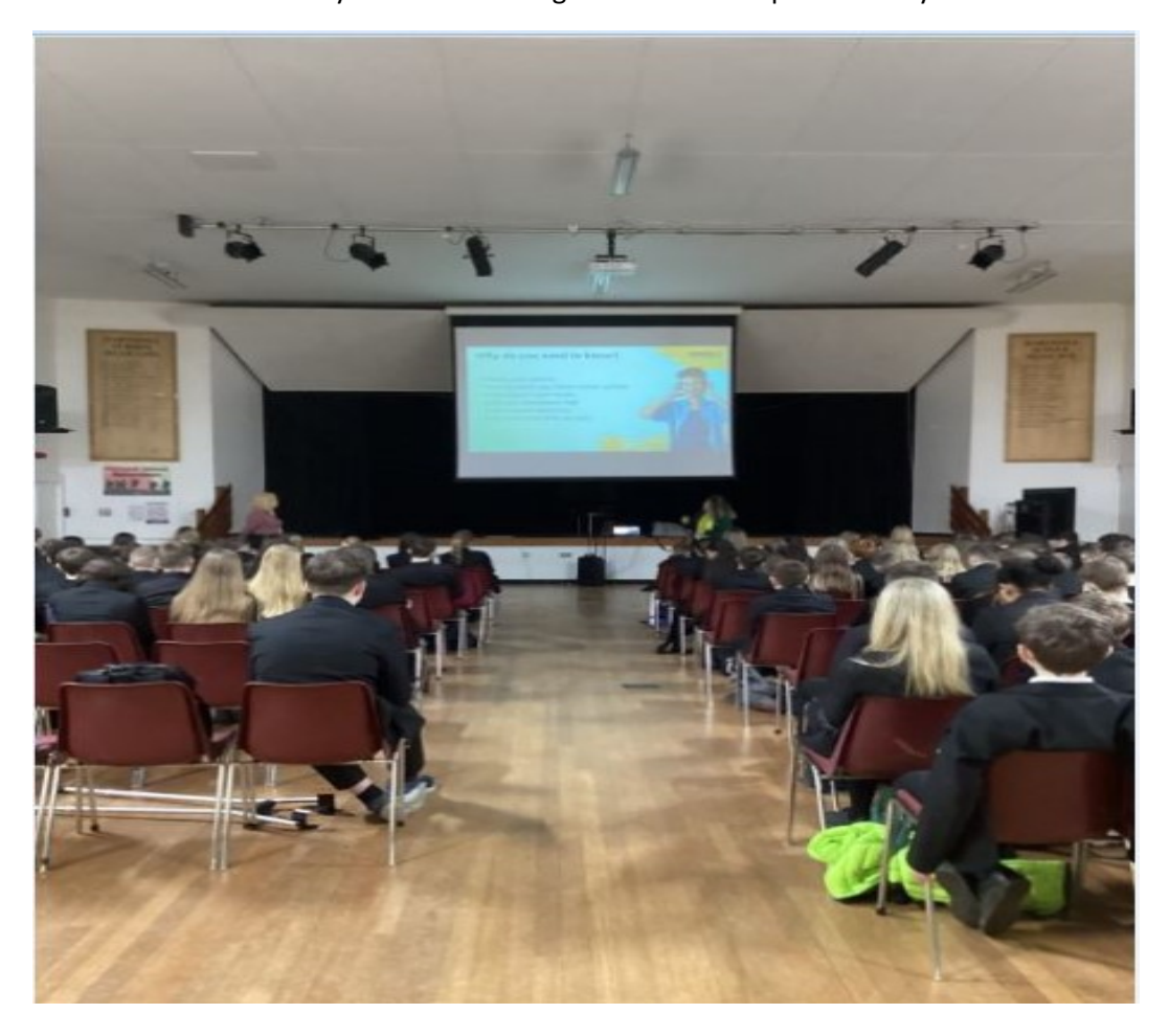
Heart – Ambition – Respect – Tenacity

This was a very beneficial assembly for the pupils and they responded really well with great conversations on what they want to be doing for their GCSE options next year.