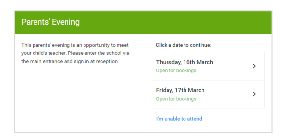
Step 2: Select Parents' Evening

A confirmation of your appointments will be sent to the email address you provide.