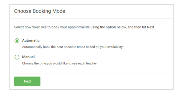
Step 3: Select Booking Mode

Unable to make all of the dates listed? Click I'm unable to attend.