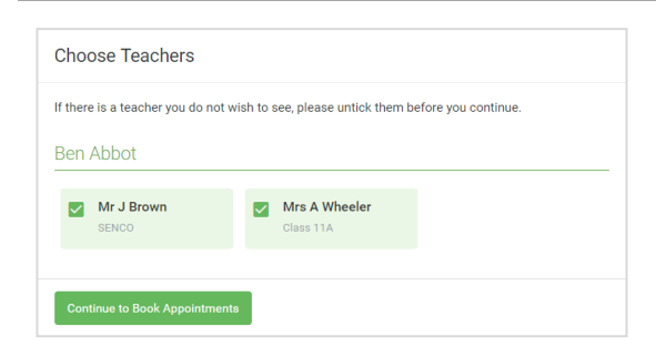
Step 4: Choose Teachers

We recommend choosing the automatic booking mode when browsing on a mobile device.